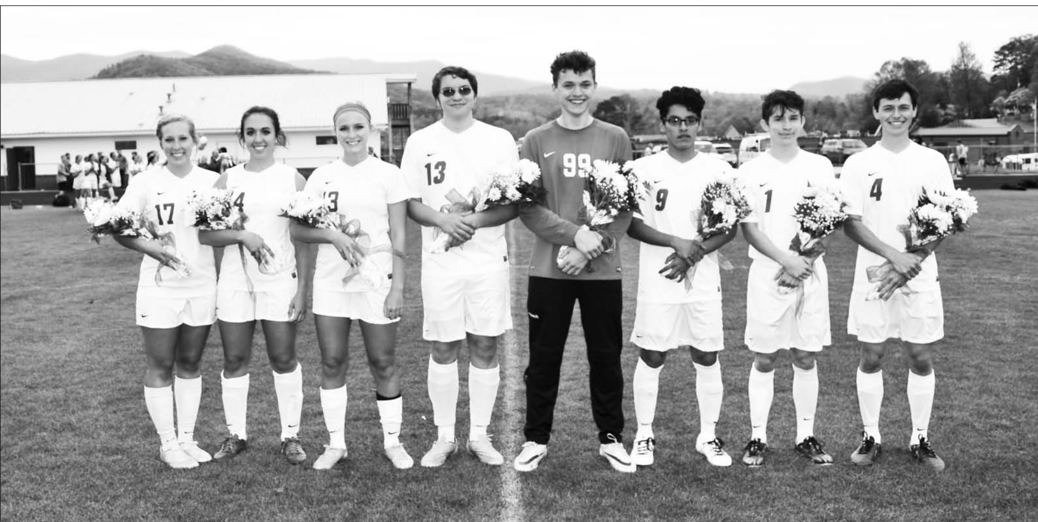
Towns County soccer celebrated its members of the Class of 2017 following last week's game with Wesleyan. The Lady Indian seniors helped turn the program around with two consecutive state playoff berths and 17 wins over the last two years. They won just 10 games during their first two years on campus.

Towns County men's season comes to a close at Class AAA Lumpkin County