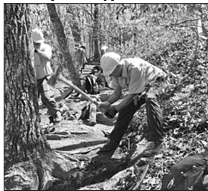
Volunteers working hard on Easter weekend.

Thirty-one members and guests of the Georgia Appalachian Trail Club interrupted their Easter weekend celebration to help "protect" the Appalachian Trail. On Saturday, April 15, 2017 just north of Unicoi Gap, (Hwy. 175 south of Hiwassee), volunteers did much more than just talk about protection by doing the hard work required. There were 32 "jobs" planned for the portion of trail worked on that day and many of the logs needed for the repair work had already been cut and waited for placement. Volunteers were divided into 7 crews and went to work early in the morning of the 15th. Many difficult problems were encountered but the crews overcame the difficulties and transformed bad trail into good trail! By the end of the day, all 32 jobs had been completed.